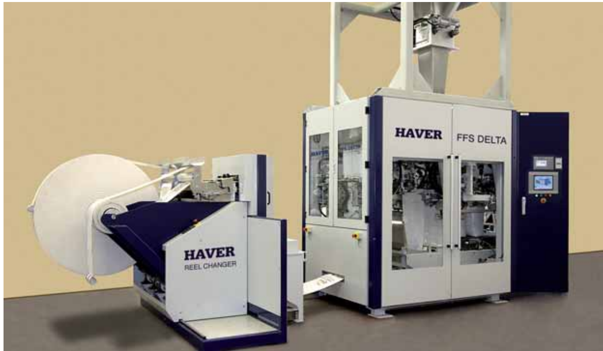
Reel Changer – two-fold reel changer